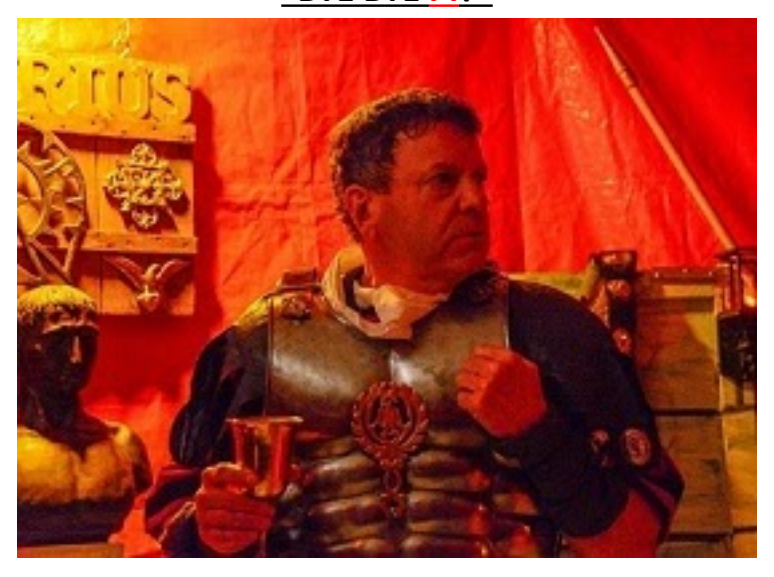
"BYE BYE PI?"