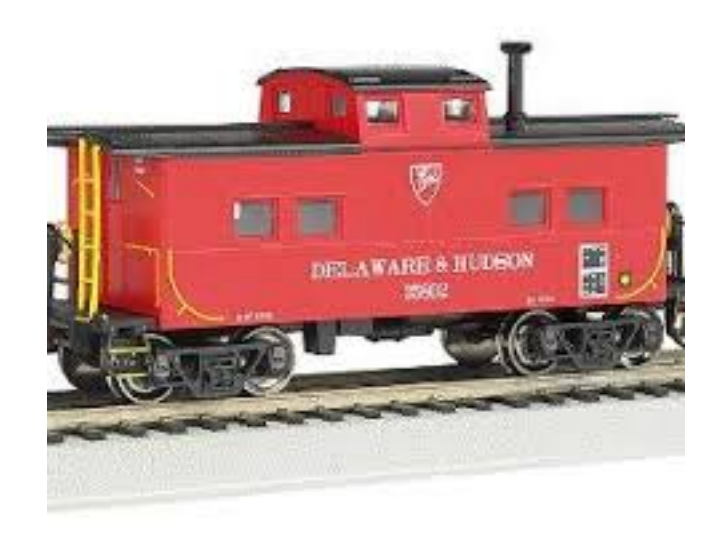
<u>Caboose!</u> On the Loose: *Lookin' out for the little guys...

"It seems to me that a Christian's sufferings are proportionate to what he or she needs (re: lack of sanctification, character flaws, etc. for reasons clear, & not so clear." [4/6/2005]. "God uses all things in people's lives to 'reveal & deal' with them." [3/3/2005]