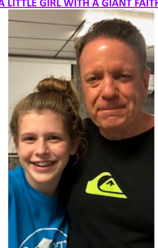
"A LITTLE GIRL WITH A GIANT FAITH"

I'm sure this man is in eternity now-perhaps for years. O God. O God. Help us, O Lord, to number our days, that we might obtain wisdom.