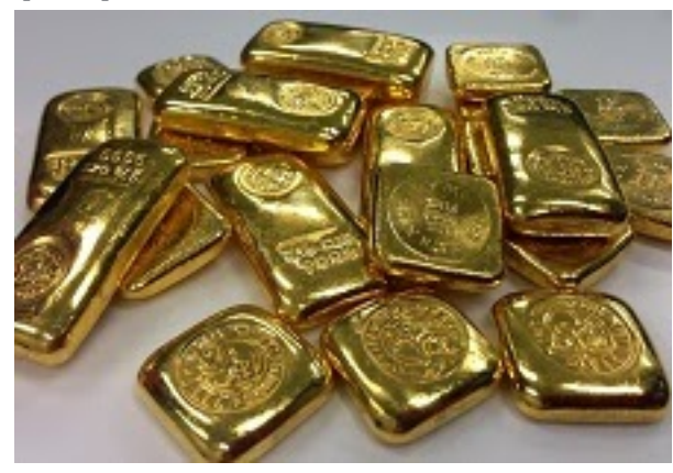
[6/18] "WALK AWAY FROM A GOLD MINE?!"