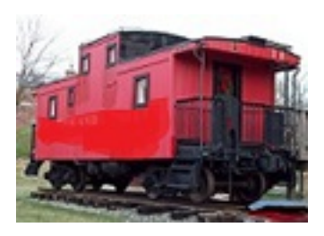
Caboose! On The Loose!