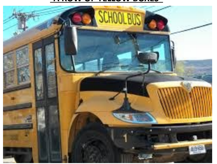
"A ROW OF YELLOW BOXES"

I headed out once again on my mountain bike with my football this morning to ride over to the ballfield at the high school across the street. I have been doing my mt. bike/football workout there for decades there. Why? I desperately need to be in shape for the summer. I have had a plethora of physical issues in the past several months, including some injuries that have kept me from working out. The regimen of camp is so rigorous that it's an absolute must that I do so. But there are other reasons too. I always listen to movie soundtracks when I work out. These are a