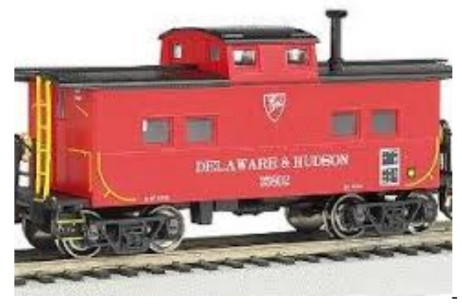
<u>Caboose! On the Loose!</u> <u>Looking Out for the Little Ones</u>

*Caboose! Commentary Corner: [Our daughter Laura once said she'd love to have my old Bibles when I passed for all of the notes I have written in them over the decades. This was quite humbling to say the least, especially coming from one of your own children. Hence, I've decided to post each month random notes/comments from Bibles I have studied from: "The most detrimental thing that can be said of any place on Earth: 'There is no fear of God in this place'". [MRG 4/5/21]