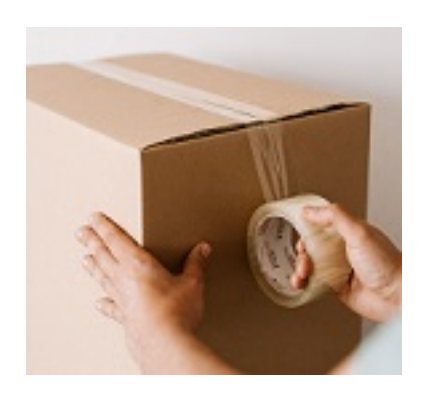
"IT'S A 'PACKAGED' DEAL"

Decades ago, there was a famous country & western song entitled, "Don't Fence Me In", re: this cowboy needing the wide-open spaces & plains of the American West. I remember as a child seeing a TV commercial that showed a small boy from the ghetto behind a chain-link fence with the end caption read-ing, "Don't Fence Me Out" which was an obvious play-on-words reversal to this popular song. After this heart-rending ministry experience at this church, that song & TV commercial came back to my mind. How so? This particular church seems very, very guarded against any kind of phenomena that might even mildly hint of a move of the Holy Spirit. Sadly, I have observed in myself, in individuals, & in various express-ions of the Body of Christ over the years that sometimes-sometimes, the very thing you strive to fence out & guard yourself against is the very thing you need! And, by doing so, you greatly rob yourself of more of God & so very poignantly stunt your spiritual growth!