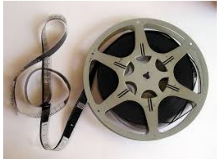
"SCRIPTURE IN SONG" Or "MOVIE 'MOVES-ME' MUSIC"

I'm sure you've either heard or read this caption, i.e., Scripture in Song. It has somewhat of a different context with me. Perhaps 99% of all music I buy is movie music. Why? It moves me in so many different ways. It helps me to "feel" the Scripture. I purposely buy music that will sharpen me spiritually, that will sober me, in a world that is drunk with a party spirit. The devil's intention is to "dull" Christians-to dilute & pollute their vision of things eternal. He knows they