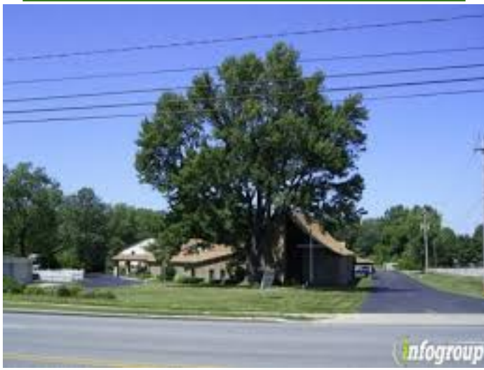
"EASTSIDE-WESTSIDE-ALL AROUND THE TOWN"

As that old song goes, that is what this ministry trip encompassed. We began on the westside of Cleveland first-at Westside Christian Academy . The Lord used three students there who had heard me preach last October at their youth group in the Cleveland area to open the door to their classical education Christian school. They told their headmaster & he graciously invited me to come [4 of our grandchildren attended this school for 2 years].