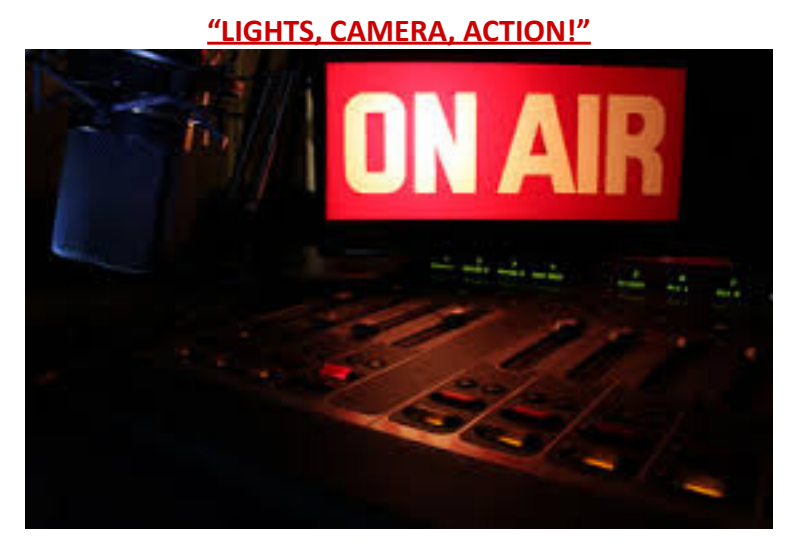
Lastly, & perhaps most importantly, movie music constantly reminds me of-yes-a movie! Not a specific movie, but of that fact that many movies tell a story-the story of an individual. It plays

There is yet another playlist that every time I hear it my mind & heart soar with excitement, vision, & intensity as I ponder a room full of kids before a children's camp or rally service. Here they come-running in-a throng of little human souls-little sons of Adam & daughters of Eve -precious-priceless-having no idea of the multitude & magnitude of the unseen forces who war for their souls. Here they come, into the room or auditorium-running, laughing-like children do-expectant for a fun-filled time-& we strive to make it that way! Yet-unbeknownst to them-we, the team-have a job to do: to be used of God to rescue them. Yes-this is what my movie music does for me-it so often lifts me to another level & dimension of vision, without which I "dwell care/less/ly"!