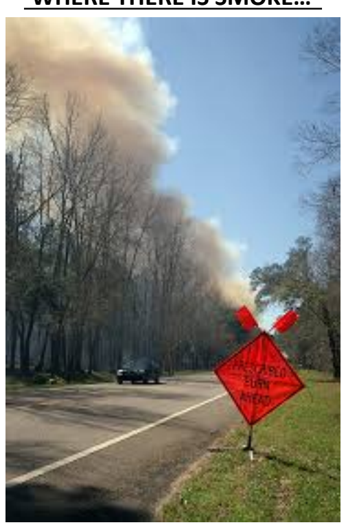
'WHERE THERE IS SMOKE..."

gospel-focused, calling-to-repentance messages-& nothing else. What a far cry this is from so much of American preaching. The text of Scripture, & the text alone, must be our bedrock, guide, & compass. If one wants to see what aspects of liberalism in its various forms has infected the Church, all one has to do is see where said liberalism has infected the world. The latter, sooner or later, always seeps into The Church.