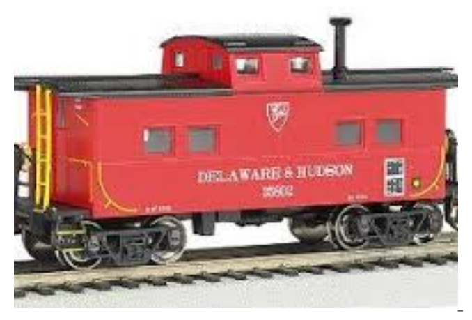
<u>Caboose! On the Loose!</u> <u>Looking Out for the Little Ones</u>

Ministry/Events for MAY & those not listed in last month's newsletter: