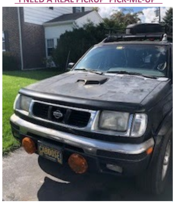
"I NEED A REAL PICKUP 'PICK-ME-UP'"

youth & men's retreats, Time Machine dramas & illustrated sermons would be on the menu. ALL 3 kinds of retreats would be replete with Scripture & systematic theology. I would both train & use some of your church people to help me with sound/tech & Time Machine dramas. A typical schedule would be a Friday night, Saturday a.m. & p.m. service. If the church so desired, I could do a "whole-church-family" service on Sunday a.m., which is my "specialty", as far as the grace & giftings our Lord has given me. The host church would have the option of having activities, snacks, meals, etc. throughout the rest of the day on Saturday until the Saturday p.m. service, OR, the children, youth, & men could just go home until then. During Covid, "flexibility" is the key. With this idea & "mode of ministry", vis, in-house retreats, ministry to these 3 groups can be continued throughout the Covid crisis. Another possibility too is to have some other churches in your area join your church in a group-church retreat-of course being conscientious to employ Covid safety measures. If you have any interest in possibly hosting one at your church, feel free to email me at ironguertin@gmail.com for more information. Thank you. Here is a YouTube link of me explaining what I mean: https://youtu.be/C-xsPv07SOA