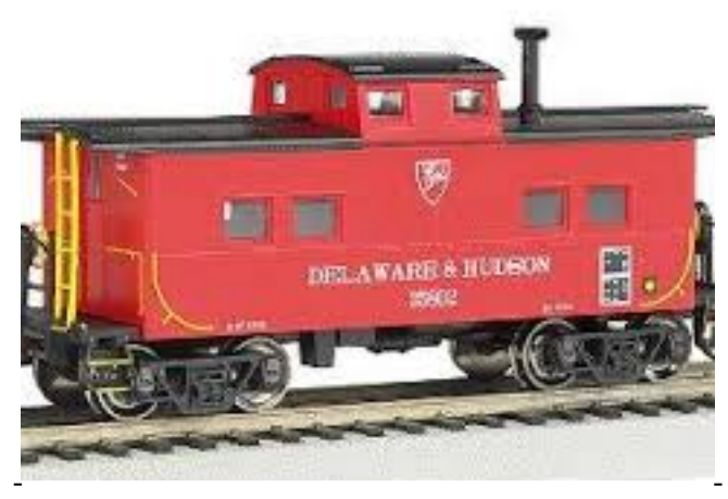
<u>Caboose! On the Loose!</u> <u>Looking Out for the Little Ones</u>