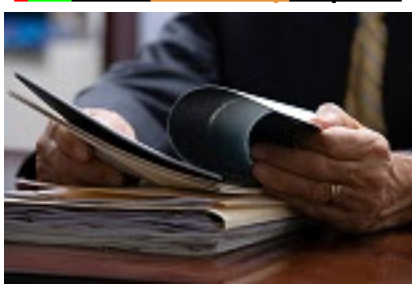
"hsc 2021 Kids Camp Report"