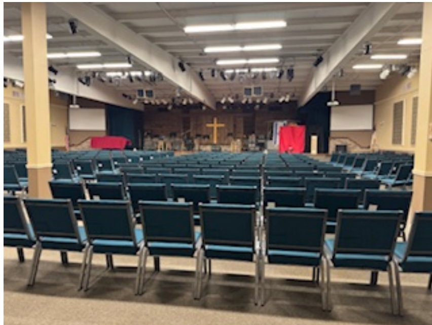
Full Gospel Center center aisle of chairs

When I am finally set up at the church for the 2 Sunday morning services, I always walk among every chair in every row & aisle, laying my hand on each one. As I do, I pray for the immortal soul who will be sitting in that chair listening to the Word of God the next day. This soul will spend eternity in one of two places, all determined on the human side by how they listen to His Word! The call to preach is a heavy, weighty, & sober call-not to mention dangerous. It is